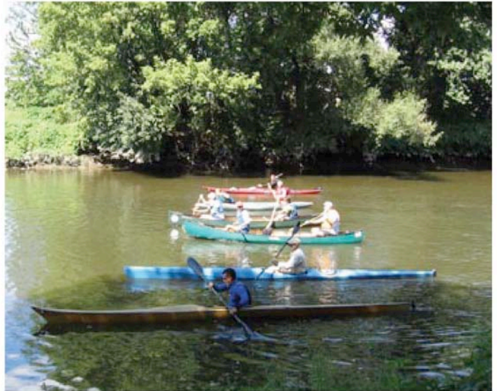
Participants in DCVA's 2007 Governor Printz Canoe and Kayak Challenge enjoy their race on the Darby Creek.

The 2007 Governor Printz Canoe and Kayak Race and Ramble was held on Saturday, September 15 th starting at the Cusano Environmental Education Center in Philadelphia. Named after Swedish Governor Johann Printz who settled along the Delaware River nearly 40 years before William Penn, the Canoe Challenge is sponsored by the Darby Creek Valley Association and others to highlight the natural and historic treasures of the lower Darby Creek Watershed. This year's event was well attended by members and non-members who enjoyed paddling down the Darby Creek or who enjoyed a good race.